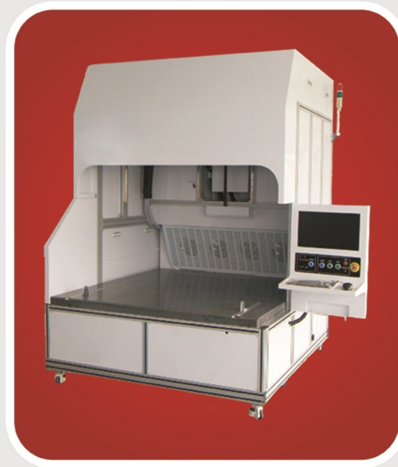
GGJG-380型激光打点机 GGJG-380 Laser RBI machine