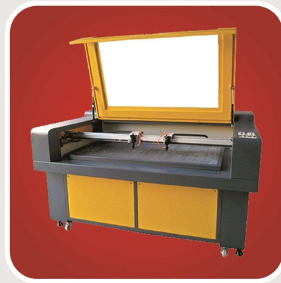
激光雕刻切割机双头系列 Laser Cutting Machine Double Series GGDK-S1060/GGDK-S1260/GGDK-S1290