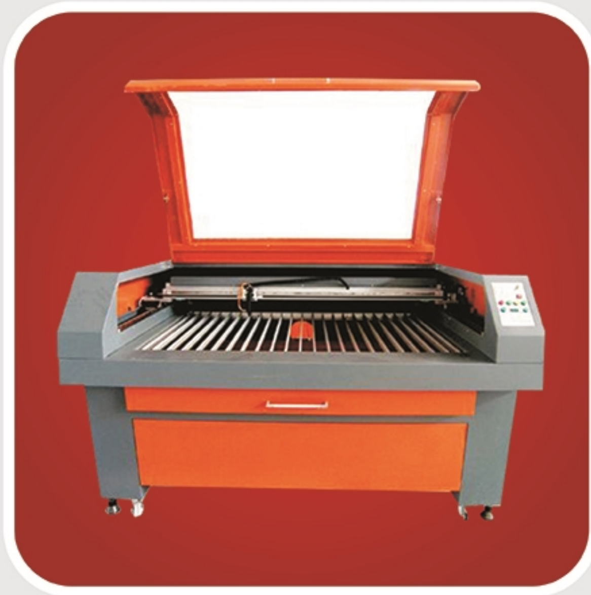
激光雕刻切割机系列 Laser Cutting Machine GGDK-1060/GGDK-1260/GGDK-1290